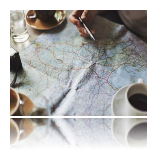
Human-to-Human Career Coaching With No Time Limits